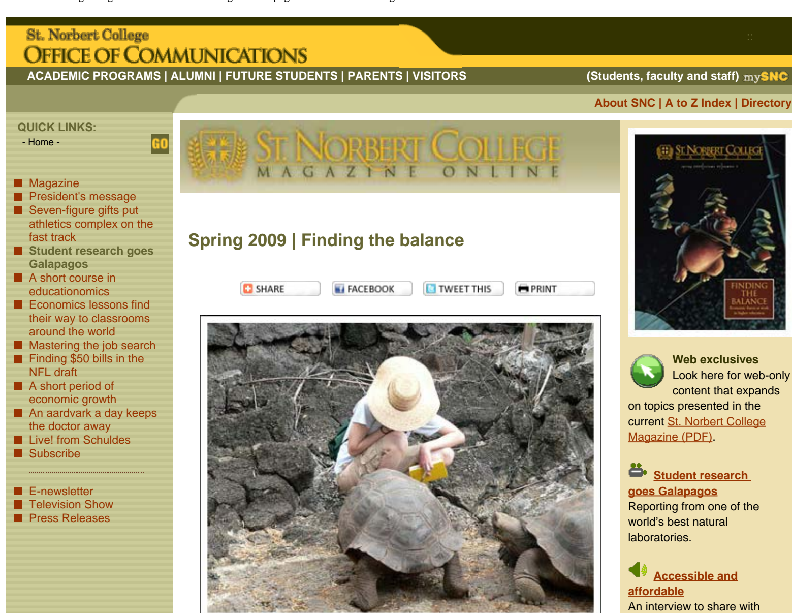
For more photos from the Galapagos view the Student research goes Galapagos video.